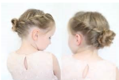
twisted ballerina bun for girls

All of our ballerinas should have their hair in a proper bun for each class. We have bun bags available for $5.00 that include all of the supplies you need (except hair gel) to make a professional looking and functional hairstyle. There are many beautiful styles that are perfect for class on line. If you need help with your hair, any of our company members will gladly show you how it's done!